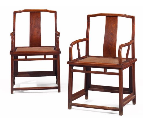
The 'Ecke Chairs', A Very Rare Pair of Huanghuali 'Southern Official's Hat' Armchairs, 17th Century (estimate: $600,000-800,000)

Additional highlights demonstrating the range of objects on offer in this sale include Sunrise Over Water , a hanging scroll by Qi Baishi (1864-1957) (estimate: $500,000-700,000); a Flambé -Glazed Vase, Qianlong mark and of the period (1736-1795) (estimate: $30,000-50,000); a 'Goloubew' Five-Medallion daybed cover carpet, Ningxia, North China, Kangxi Period (1662-1722) (estimate: $20,000-30,000); and an Imperial Yellow-Glazed Cup, Yongzheng Mark and of the period (1723-1735) (estimate: $30,000-50,000).