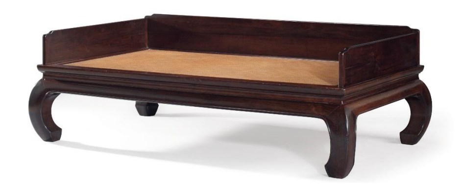
An Important Zitan Luohan Bed, Luohanchuang, 18th Century (estimate: $2,000,000-3,000,000)

The Virata family focused on works with distinguished provenance, superior condition and esteemed publication history. Many of the furniture pieces have appeared in major international exhibitions of Asian art, and previously belonged to important collectors and scholars in the field. Highlights include a pair of very rare 17<sup>th</sup> century huanghuali 'southern official's hat' armchairs (estimate: $600,000-800,000), which come from the collection of Gustave Ecke, and appears in the groundbreaking 1944 book Chinese Domestic Furniture , as does a huanghuali lamp stand (estimate: $120,000-180,000), formerly of the famed Pan-Asian collection; a very rare huanghuali kang table dating the Wanli period (1572-1620) (estimate: $500,000-700,000); a rare pair of zitan 'offical's hat' armchairs, sichtuguanmaoyi (estimate: $800,000-1,200,000); and an important zitan luohan bed, luohanchuang , 18<sup>th</sup> century (estimate: $2,000,000-3,000,000).